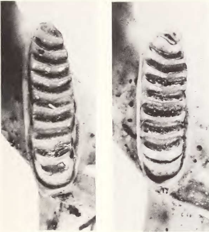
Fig. 4: Right lower molar row of O. occidentalis , holotype (left) and of O. irroratus . M_1 has five laminae in occidentalis and four in irroratus .

5. Seen from the side the skull is flattened and slightly depressed in the posterior frontal region, both in occidentalis and barbouri . In irroratus , however, it is evenly arched.